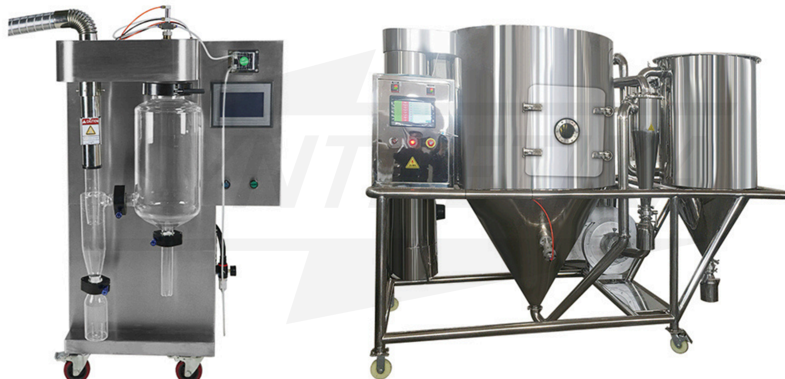
• SD-2L • LPG-10L