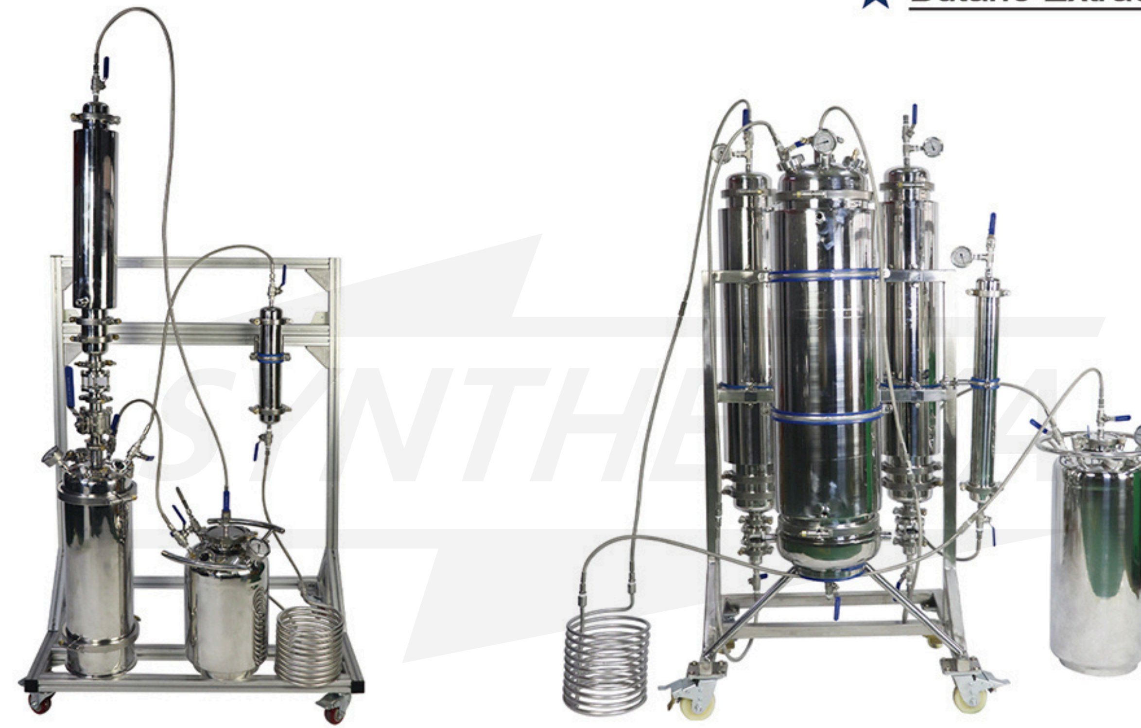
• 2LB • 10LB