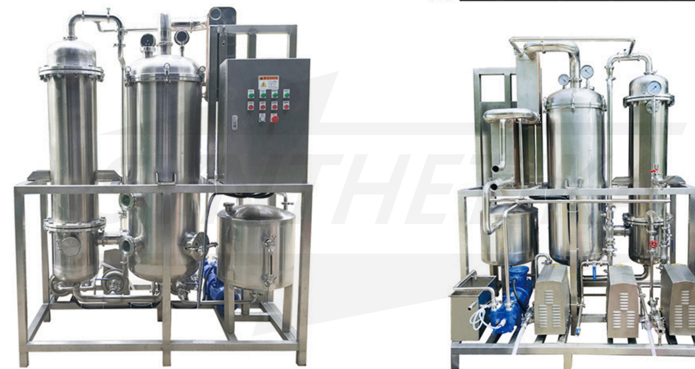
• Front Display • Back Display