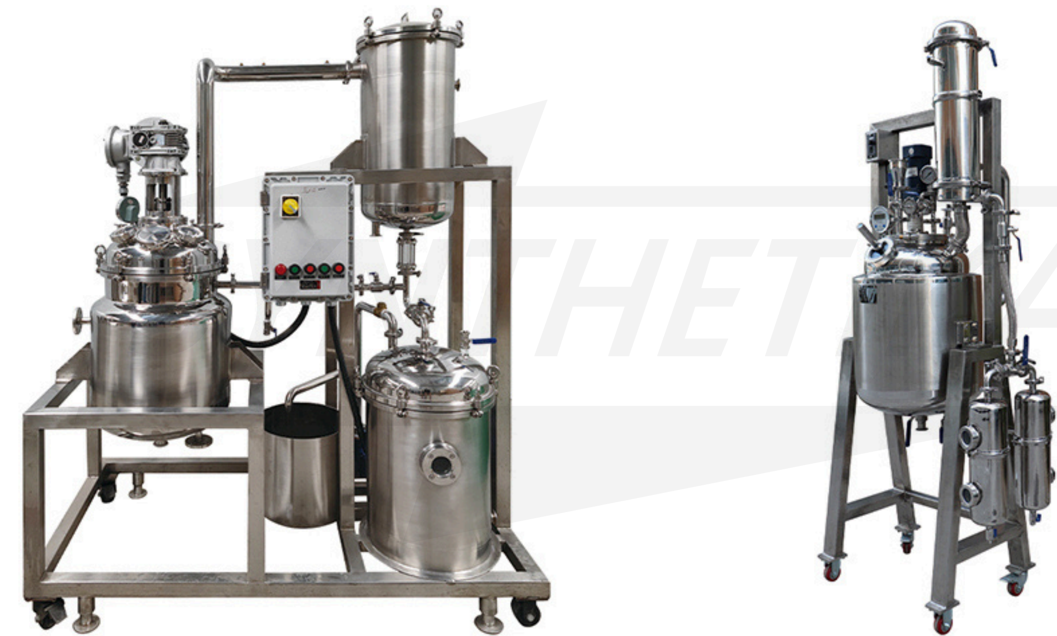
• SSC-100L • SSCC-50L