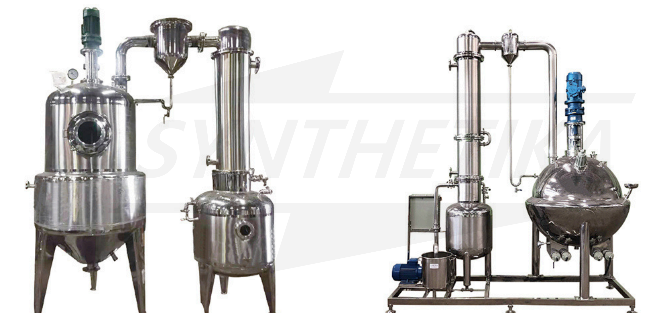
• Vacuum Concentrator-Conical • Vacuum Concentrator-Spherical

★ Efficiently Concentrates Samples, Saving Time