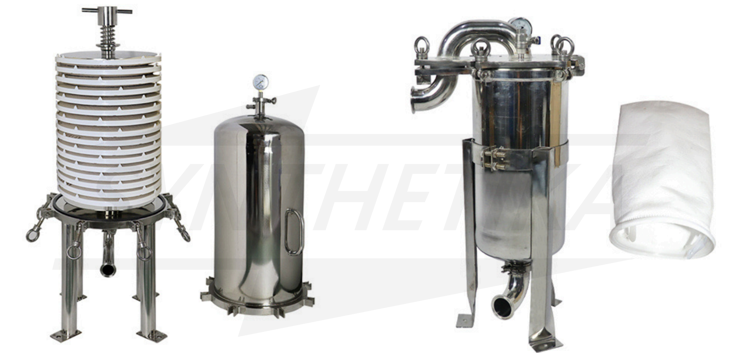
• Lenticular Filter • Top Entry Filter